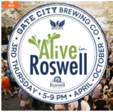
Alive in Roswell Oct. 17 5pm Hagan Center Booth Sponsor: